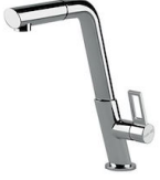
Mixer Tap KE