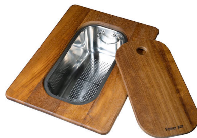
Iroko-wood sliding chopping board with stainless steel colander 8644 044

* only in combination with the accessory 8644 101